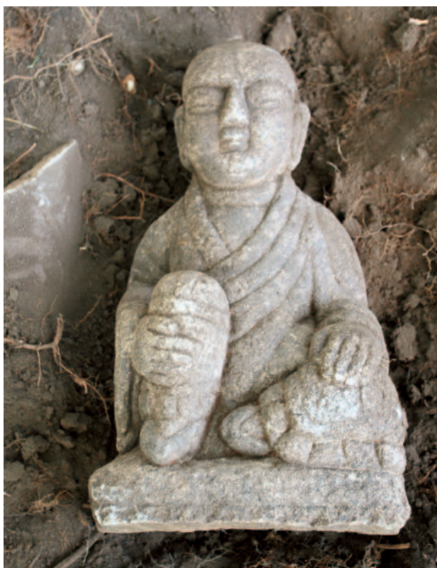
Figure 8. The Stone Statue of a Buddhist Monk Unearthed from J1 of Architectural Complex A

The whole unit was composed of the subsidiary room on the east (J2E1) and the main hall on the west (J2W1), and the entrance might be set at the subsidiary room (J2E1). The longitudinal length of J2E1 was slightly larger than that of the main hall (J2W1), but it is severely damaged. It was modified or rebuilt for at least one time, and its remains could be identified as containing two phases. The early phase of J2E1 was a semi-subterranean structure with a hearth in the southwestern corner, the firebox and fire tunnel of which were linked to the Kang (heatable brick bed) in the main hall. On the north and south sides of the hearth, seven porcelain or pottery jars are found, one pottery jar of which had a small pottery jar and two bronze coins in it. This room might be used as a kitchen. The floor of the late phase is damaged, and the bricks paved on it are all missing; from the ground, iron knives, scissors, arrowheads and other implements were found. To the south of the west wall, a rectangular stone threshold is found with two door frame-bearing stones flanking. A doorway leading to the main hall is found here.