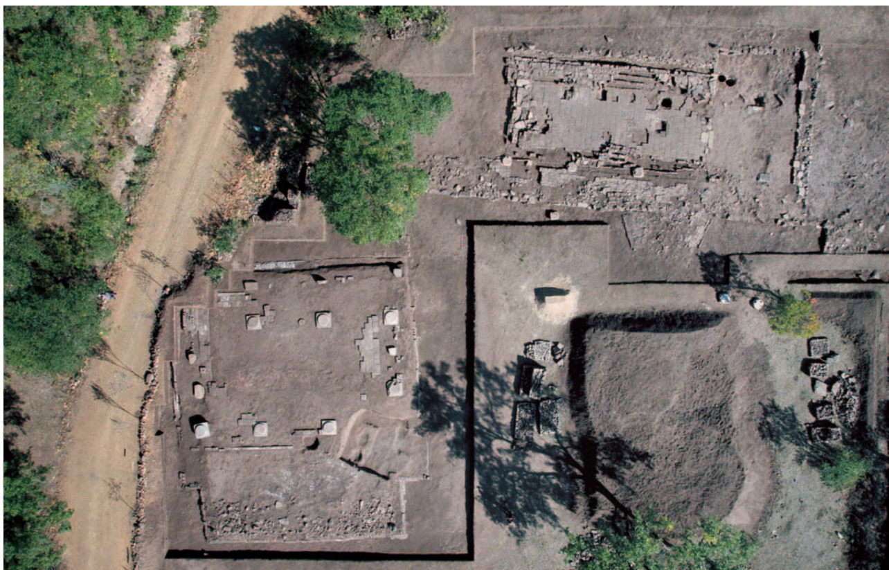
Figure 7. Architectural Complex A (Top is North)