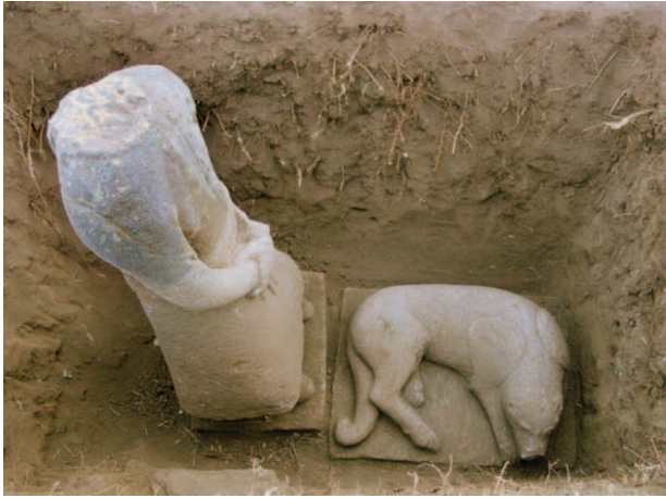
Figure 1. The Mausoleum Sculptures in situ Nearby the Underground Hall of Zuling Mausoleum

ing Hall recorded in Liao Shi , one of the important places to hold sacrificial ceremonies. On the south slope of this ridge is a zigzag mounting path about 5m wide and 300m long. On the left side of the entrance of the mounting path at the foot of the ridge, there is a small-sized architectural foundation.