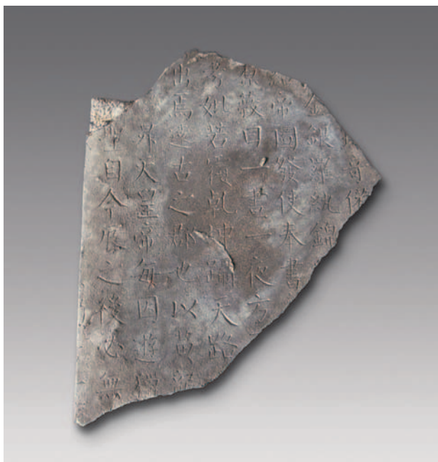
Figure 12. The Stele Fragment with Chinese Characters Unearthed from the Architectural Foundation on Guifu Hill

four diagonal sides of the tortoise-shaped stele pedestal; engaged pillars are found in the adobe walls on the four sides, four on each side. Outside of the adobe walls, the brick pavements are as wide as 4m. Around the architectural foundation, there were dado stones and brick-paved aprons. According to the pillar arrangement, this architecture on Guifu Hill could be restored as a double-eave building with a hipped roof.