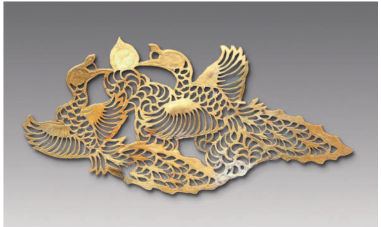
Figure 4. Gilt Silver Double-phoenix Ornament (PM1:239)

Facing the south, J2 was also a brick-and-timber structure, the east, north and west sides of which were brick walls and the door and windows were set on the south side, and the floor was paved with square bricks.