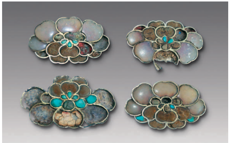
Figure 5. Silver Ornaments Inlaid with Gemstones (PM1:232-1 to 232-4)