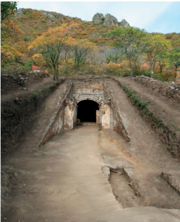
Figure 3. Attendant Tomb No. 1 (SE-NW)

chambers and two side chambers are all in square plan with curved corners and with dome-shaped ceilings. Just like the front corridor, the rear corridor also had brick sealing wall in the front and wooden door remnants in the back. The rear chamber is 6.85m long (E-W), 6.9m wide (N-S) and 5.5m high (remaining height). In the middle of the back half of the rear chamber is the coffin platform built of bricks, the front and two sides of which have color-painted brick arch-shaped shrines and columns. The gold-plated wooden dragon heads unearthed nearby the coffin platform hinted that there would have been burial furniture like house-shaped wooden outer coffin on the platform. The top surface not covered by the outer coffin is decorated with floral designs.