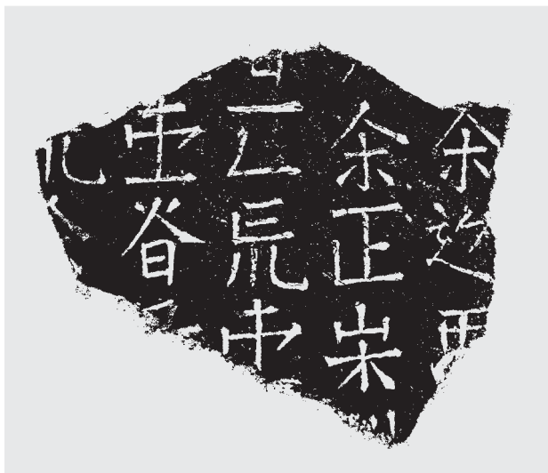
Figure 10. The Rubbing of a Stele Fragment with Khitan Large Characters Unearthed from the Architectural Foundation on Guifu Hill