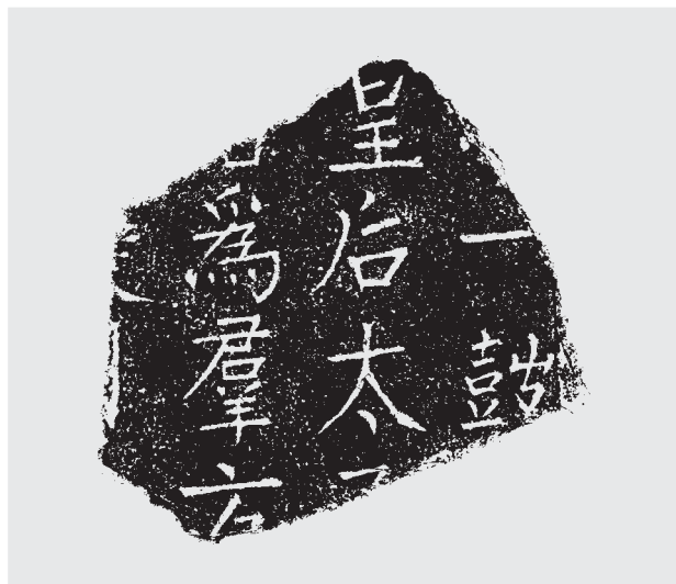
Figure 11. The Rubbing of a Stele Fragment with Chinese Characters Unearthed from the Architectural Foundation on Guifu Hill