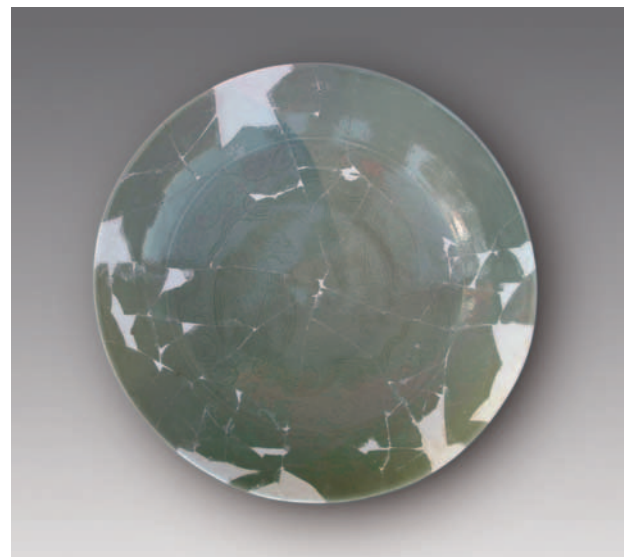
Figure 6. Green-glazed Porcelain Washer with Double-phoenix Design (PM1:134)