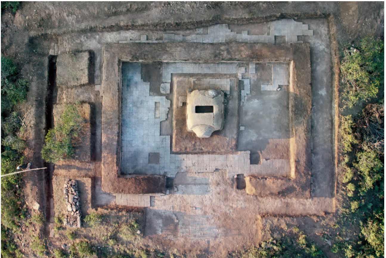
Figure 9. The Architectural Foundation on Guifu Hill

Four pillar base pits are found symmetrically on the